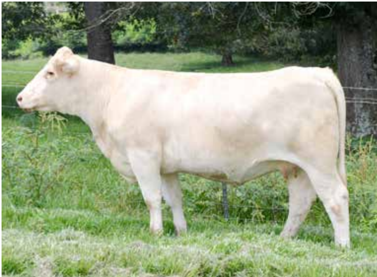
OHF VANESSA H813 ET SELLS AS LOT 44

Due 11/14/21 to Welcome Grove Raven 1824 ET, EM914413. Paternal sister to Lot 44 and full sisters in blood. Again, double the purchase and double the pleasure and PROFIT! When you study pedigrees you will notice how many cattle can trace back to Cigar, even show sires like TR Mr. Fire Water 5792RET. (Fire Water has 4,040 progenies registered with AICA). Another proof of Cigar is he has been linebred more than most without any problems!