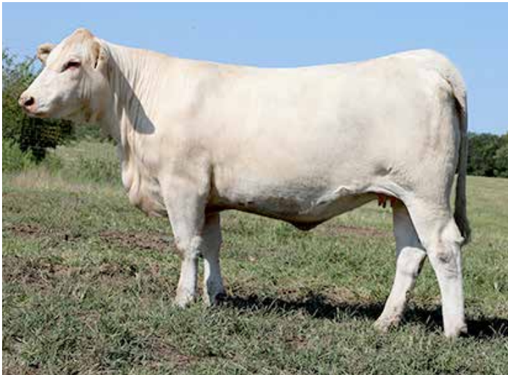
LCC MELODY'S ELLA 1160 SELLS AS LOT 98

97A: Pld bull calf, born 8/13/21, sired by ABRJ New Hank 595 P, M875188. New Hank ranks in the top 10% for WW, 8% YW, 25% Milk, 15% MTL, 1% SC, 3% CW, 6% REA, 3% Marb, and 4% TSI. These calves will have great value sired by him and out of the 745 donor! He is a New Standard 842 out of a BJR Hank 984 daughter mixed with Polled Value 9089. You can't go wrong with the popular and well established genetics of 745.