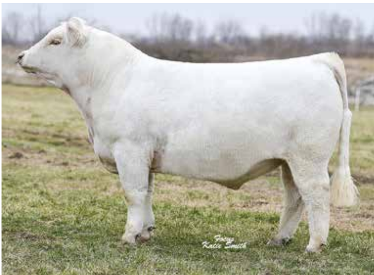
AML GHOST RIDER 210 LOT 79 SERVICE SIRE

Bred A-I on 12/6/20 to Silverstream Evolution, M809162, PE to Faraway Valor, EM920863. Should calve to Evolution before sale. Dam, daughter, and sister still in herd. Triple bred Grid Maker, out of the same cow family as Fink Gold Standard, and WCR Duke 0627 to mention a few. Light birth weight with good weaning weight and ratio, 104%. Above avg in WW, YW, MTL, CW, and Fat EPDs and above 10% in Udder and Teat.