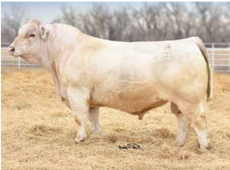
RBM FARGO Y111 SIRE OF LOT 86

85A: Pld bull calf # 2120, born 8/18/21, bw 72, sired by M6/LF Rushmore 978, M926460, a calving ease sire. Cow sells Open. This pair should have many friends sale day! One of my picks out of our 1st calf heifers pasture. She has a beautiful udder quality and super set of calving numbers, ranks in the top 9% CE and 7% BW EPDs. Her dam has a great CI record, 7/15; 9/16; 9/17; 9/18; 8/19; 8/20; and now 8/21. This cow is fertile!