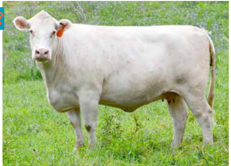
REAVES MS DUKES LEDGER 356 SELLS AS LOT 22

Safe in calf, due sale time to M6 Law & Order 577 P, M875914. A son of M6 Cool Rep and M6 New Nancy 274. 356's dam 1705, topped the Stallings Sale several years ago at $15,000. An own daughter of the legendary Cigar 248 donor cow of Double-H and now Southern Cattle Co. 356 ranks in the top 35% WW, 25% YW, and in carcass EPDs ranks in top 25% for both Marb and TSI. Solid pedigree and strong conformation broodcow!