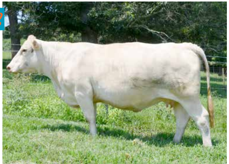
OHF VANESSA H815 ET SELLS AS LOT 42

Due 9/2/21 to VPI Free Lunch 708 P. An exciting coming first calf heifer from a well-established background of breed leading genetics. Her dam is a full sib to JWK Vanessa D029, a stalwart of the industry. 280 already has 34 calves registered with AICA and her exceptional foundation Lady Performer 934 has 128 offspring registered. If you want to build a solid foundation on stone, this lot offers everything good about the breed!