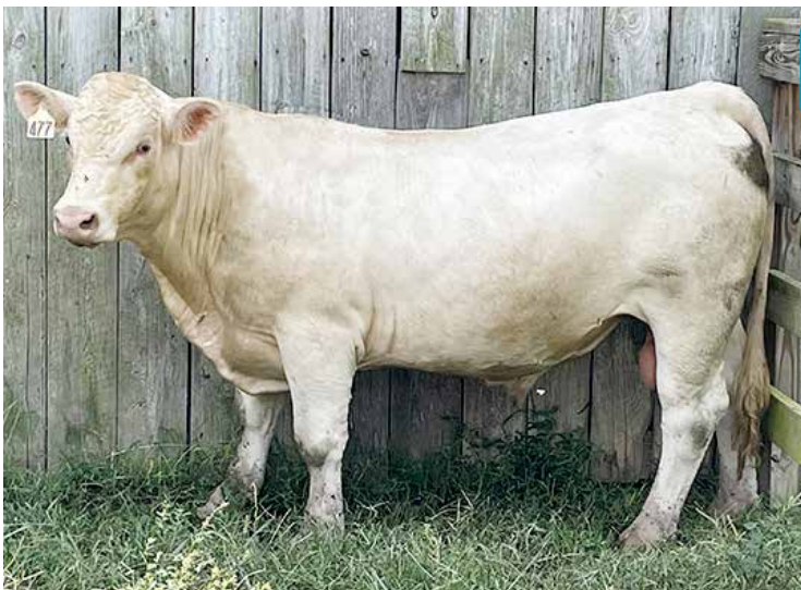
RRCA MR H477 SELLS AS LOT 15

Selling Full Interest and Full Possession, Fertility & Trich Tested. Out of our newest Lindskov-Thiel acquisition, LT River Dance. He has certainly fulfilled his expectations! Super length and stretch in this top selection. Excellent scrotal development along with his overall conformation and growth pattern! His dam's CI is 1/17; 1/18; 3/19; 1/20; 1/21 for super impressive fertility. She is now owned by Cawley Cattle Co. GA.