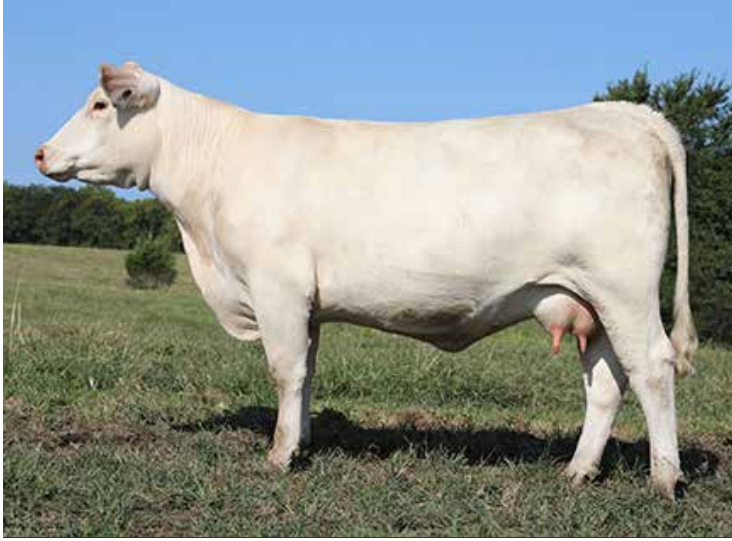
LCC TEXAS STARBRIGHT 1279 SELLS AS LOT 97