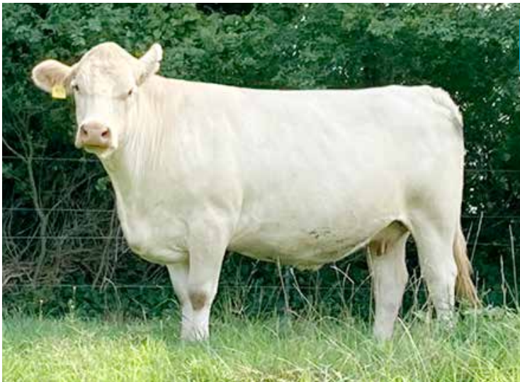
FARAWAY MISS 110C SELLS AS LOT 78

Bred A-I on 12/6/20 to WAG Bacchus Cotano. PE to Faraway Valor, EM920863. Her dam, 39X, has been very productive with 14 calves. 39C has had 4-calves, 2-daughters remain in the herd along with dam. Ranks in the top 10% for Udder and Teat EPDs and above avg in Milk and Scrotal EPDs. Her dam was very successful in the show ring winnings. A National Class winner and top 10 Show Heifers of the Year!