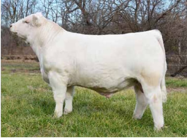
WC MILESTONE 5223 P SIRE OF LOT 25