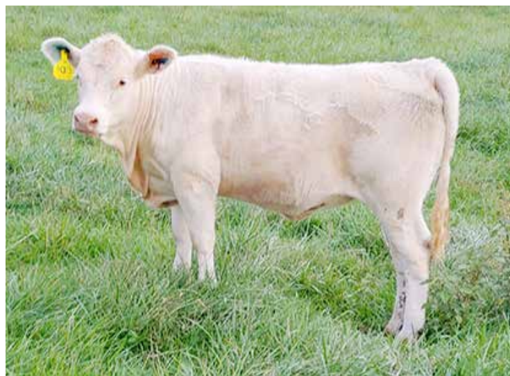
WC ROSALEE OD1 SELLS AS LOT 38

37A: Pld ET Bull calf, #0521, born 5/22/21, bw 86, from embryo mating of VCR Sir Duke 914 x Julieta 1N5 B309 Y 46 ET. Bred A-I on 7/27/21 to DC/CJC Sugar Daddy G1118 P, M936533. Great CE and BW EPDs ranking in top 2% and 7%, 6% Milk, and 15% MTL. Powerful bred ET bull calf at side out of an ET sister to JDJ Smokester J1377 P ET, (Cigar x JD Ms Commander B309). Sugar Daddy was the high selling bull in the 2020 DeBruycker Bull Sale.