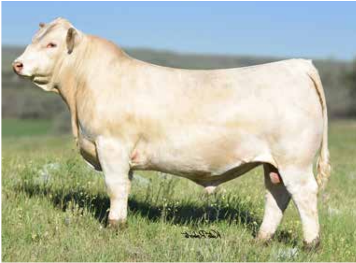
LT AFFINITY 6221 PLD SIRE OF LOT 85