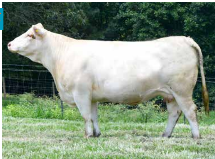
WC GIGI 776 SELLS AS LOT 56