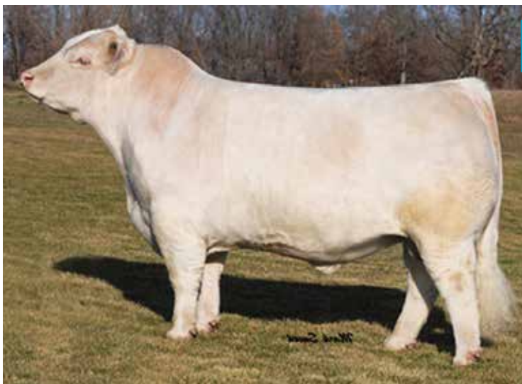
KEYS ALL STATE 149X SIRE OFL OT 63