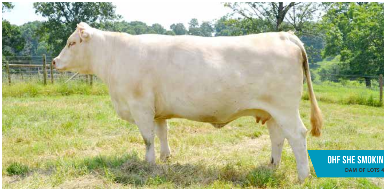
OHF SHE SMOKING D823 ET DAM OF LOTS 46 & 47