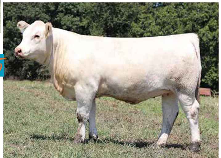
LCC TEXAS PROUD MARY 1741 SELLS AS LOT 95

RAILE J827 A005 SCC MISS PV731 72Y PLD PV CHISUM 1121 PLD PV TOP PRO 1135 PLD WCR SIR DUKE 761 WCR MISS MAC IV 534 LHD CIGAR E46 CR MISS DUKE 172