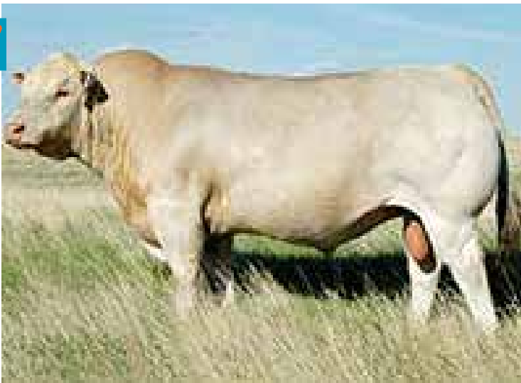
LT LEDGER 0332 SIRE OF LOT 61

Bred A-I on 5/20/21 to DC/CRJ Tank E108 P, called 80+ days safe on 8/3/21. Her dam 7515, has 53 calves registered with AICA. She has produced many show winning progenies for Ridder Farms, MO. DR Stealth 574 was Denver Champion and has been a top producer with 451 progenies registered with AICA. The Tank calf will have tremendous marketing potential but will be very hard to part with!