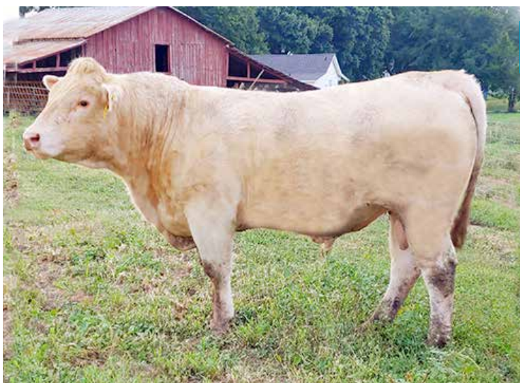
WC COJIMAR 903 ET SELLS AS LOT 8