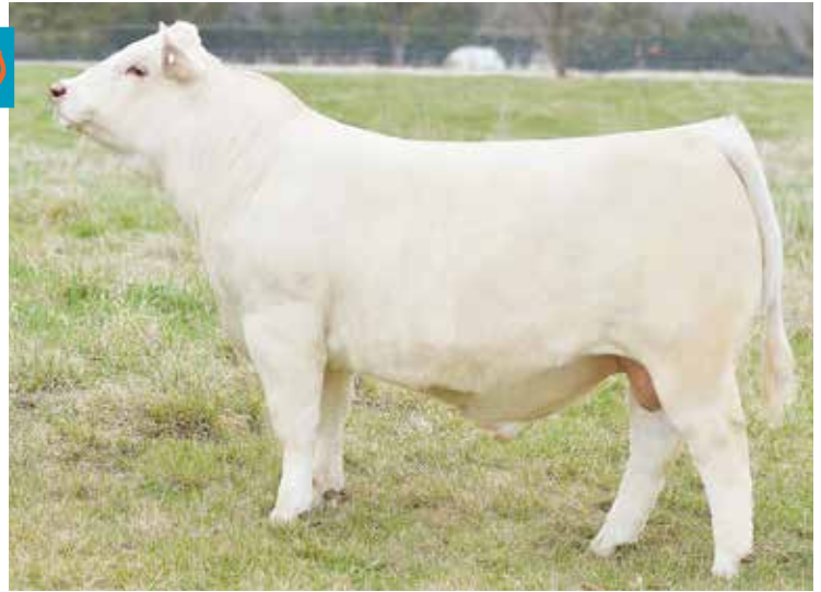
CCC WC RESOURCE 417 P SIRE OF LOT 80

80A: Pld bull calf # 26711, born 4/12/21, sired by PJ Patriot 605P, M889191. PE from 5/22/21 to sale to AML Ghost Rider 210, EM830495. Her dam is a top producer and has a full sib to 2672 selling as Lot 81. The BPC Miss Montana is out of ABC Leader L165, a Cobb bred bull and G366, a high selling Ali Mark cow in a previous Sale of Excellence to Bruner Polled Charolais. Her Patriot bull calf will be a money maker!