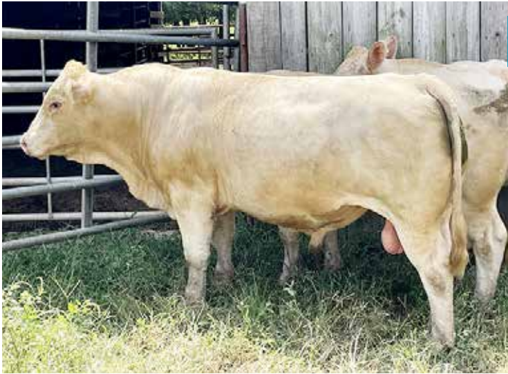
RRCA MR H434 SELLS AS LOT 13