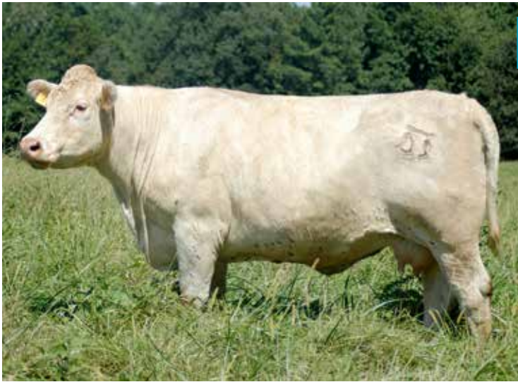
CJC MS OUTBACK R2029 DAM OF LOT 71

70A: Pld Heifer calf # P02, born 3/28/21, bw 81, sired by TR CAE Carbon Copy 7620E, EM896198. Bred A-I on 6/2/21 to CJC Trademark H45 P/s, Safe in calf. Maxine is one of those great phenotype cows, very smooth, complete, correct, good size, and great quality udder. Baby at side is a top SHOW CALF prospect! Maybe one of the stoutest, thickest, best calves we have ever raised! Great proven pedigree with MCF Lady Gi Duke 5003!