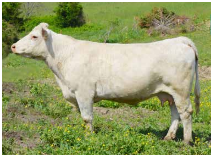
SRC MIRANDA U805 DAM OF LOT 57 EMBRYOS