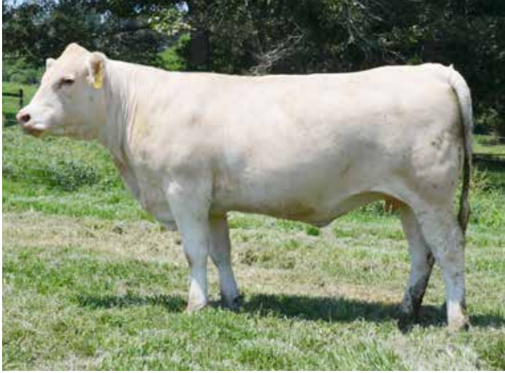
RE W950 ALEXA 914 ET SELLS AS LOT 49