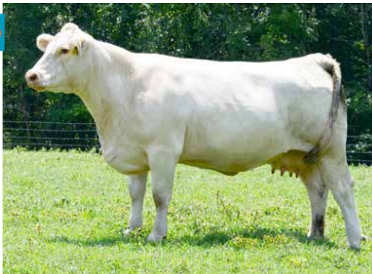
WEAVERS FRESH VERONICA 1410 SELLS AS LOT 60

60A: Dehorned bull calf # 2103, born 4/20/21, bw 95, sired by RBM Fargo Y111. PE from 4/21/21 to sale to DESCO Del Rio 512 P ET, EM866530. Del Rio is a Rio Bravo 3181 son out of Hales MS Grid 717, owned by Timmber Farms. CI for 1410, 7/16; 12/17; 12/18; 3/20; and 4/21. Veronica ranks in the top 2% for WW, 6% YW, 9% MTL, 15% REA and Fat, and 9% TSI for breed EPD comparisons. Notice the 112% Weaning ratio!