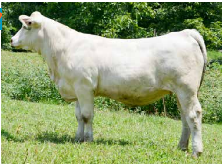
WELCOME GROVE ARLEEN ET SELLS AS LOT 62