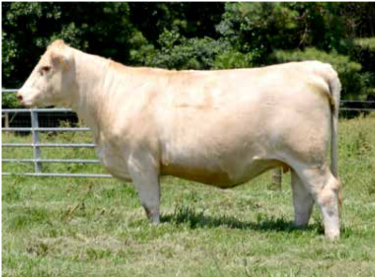
JK WANDA 913 SELLS AS LOT 50