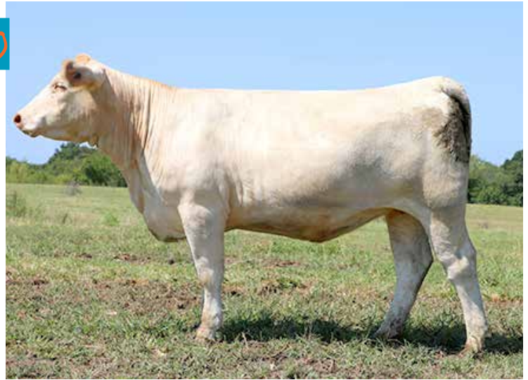
LCC SWEETHEART 1820 SELLS AS LOT 100

Bred to JMAR Lead Time, DUE 12/26/21. PE from 4/7/21 to 7/6/21 to Mead LCC Bulls Eye T484, M924529. This heifer exudes femininity and style! A strong top with square rump with good depth of body and spring of rib. She also excels in CE, 7%, BW 9%, REA 15% and Marb 5% for EPDs in the breed. A stacked pedigree of Who's Who in the breed adds value and promoting ability!