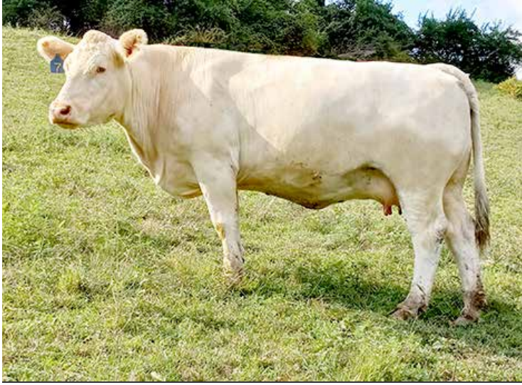
DC LADY MAXINE P SELLS AS LOT 70