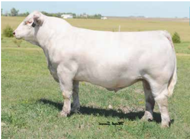
RBM TR RHINESTONE Z38 SIRE OF LOT 7