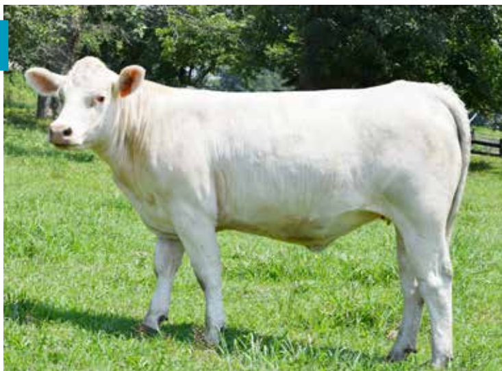
B&B MS LADY LIZ 920 SELLS AS LOT 74

PE from 5/30/21 o 7/1/21 to WC Up The Ante 6277 P, M880846. Ante is a son of WC Up The Limit 1128 from Wright Charolais. His dam traces to Clarice J139 on the bottom side. This smooth made, correct heifer offers tremendous femininity with excellent growth, good volume and thickness. If you study her pedigree you will find she descends from some of the best in the breed, Vanessa's, Verna's, and Liz cow families.