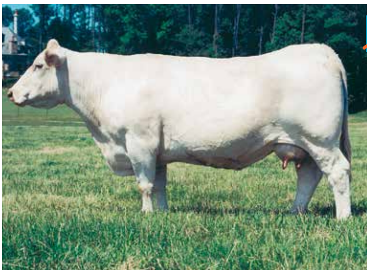
DC/JDJ PEGASUS D3330 P SELLS AS LOT 109

Selling 10-units of semen on DC/JDJ PEGASUS D3330 P. His first daughters have calved and they are knocking it out of the park! You will be so impressed with his daughter's udder quality. Look at his EPDs, they also reflect tremendous growth and carcass. Very solid genetics and they have superb dispositions! Several Pegasus sons have topped bull sales! Try something different for awesome results!