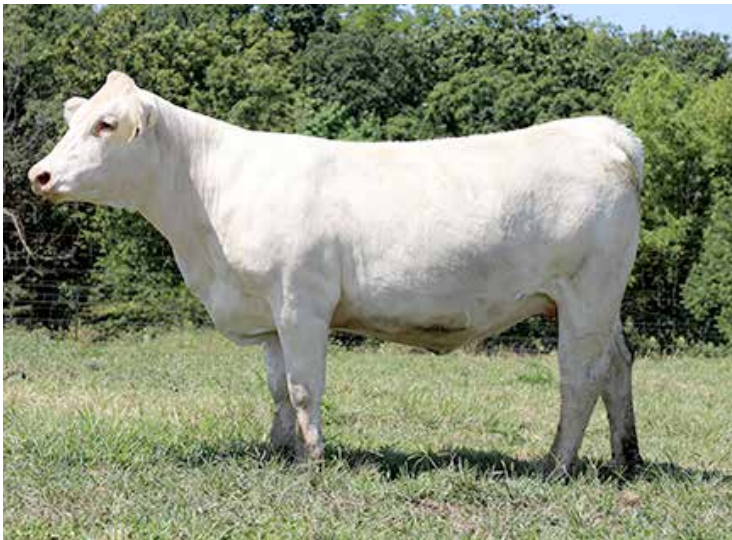
LCC MONTANA QUEEN 1479 SELLS AS LOT 99

Bred to JMAR Lead Time, DUE 12/26/21. PE from 4/7/21 to 7/6/21 to Mead LCC Bulls Eye T484, M924529. Look and eye-appeal are bred to the bone for this young female with being a line-bred Wrangler and stemming back to a Firewater. Her phenotype sticks with you! She ranks in the top 3% YW, 5% CW, 5% REA, and 2% TSI EPDs. Foreman has worked extremely well for our program, great daughters.