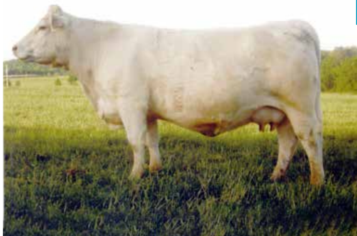
CF LADY CIGAR 812 DAM OF LOT 59

Sells Open. Super sharp show prospect out of a donor cow formerly owned by Rocking S, then syndicated by Arlitt Ranch, TX., and Timmber Farms, MS. She has produced 9 calves, one, a Maximo bull sold for $5500 to a buyer in New Mexico. When he sold a group of cows, the buyer would only take them if he also got the bull!! Ann ranks in top 15% for Milk, 25% for MTL, and 1% FAT. Duke 914 is one of the most proven bulls in the breed.