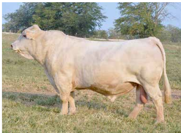
LT RUSHMORE 8060 SIRE OF LOT 37