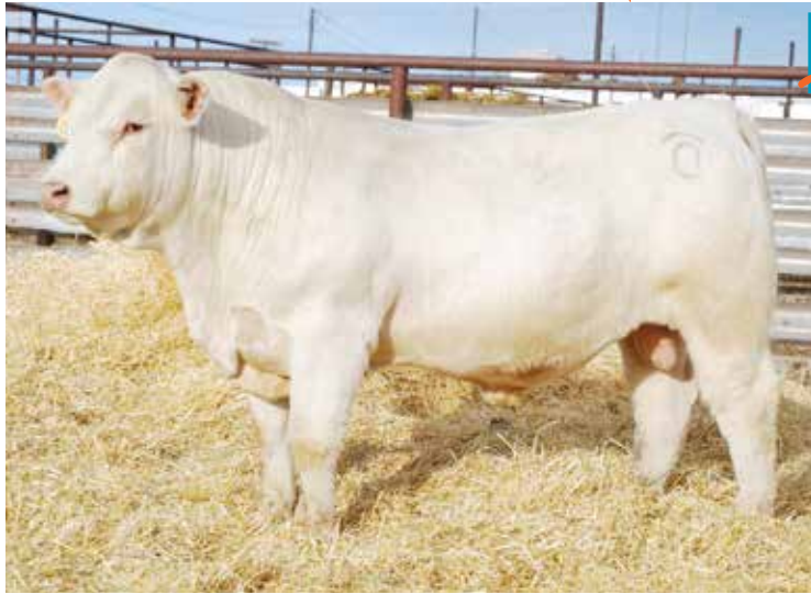
DC BHD KING F2503 P SIRE OF LOT 103