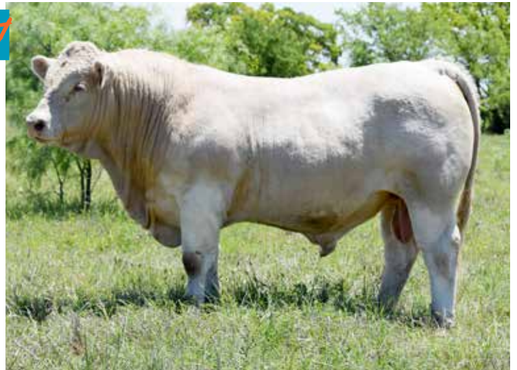
RE SIR BRAXTON 022 ET SELLS AS LOT 107

Selling 10 units of semen on RE Sir Braxton 022 ET. One of the most exciting young sons of the Canadian sire, Sparrows Braxton 519C. Even more credibility is his superb donor mother, JDJ Ms Cigar B2011. She has been one of the great additions to the breed. She comes from a well proven past in her donor dam, R120. Her calves have been topping sales and she is a prolific producer! Sir Braxton is one of the stoutest, most powerful young prospects to come along in some time!