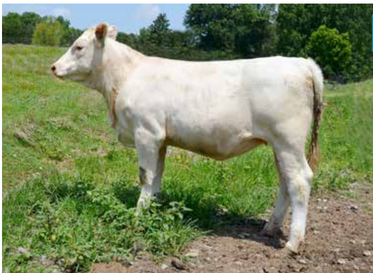
WELCOME GROVE RUBY 2020 ET SELLS AS LOT 64

63A: Pld bull calf born 7/19/21, sired by LT Patriot 4004 Pld, M852822. He is a twin to heifer that will not be selling. Cow will be selling Open. Rich pedigree tracing back to DesireP37P, a Mac 2244 x HBR Lady Performer 934, a full sib to JWK Vanessa D029. P37 had 22 calves registered, 2123 had 29 calves, and 3225 has 13 calves registered with AICA. Clear Water has also used this cow in their elite program.