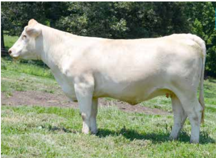
OHF SHE VANESSA H822 ET SELLS AS LOT 45