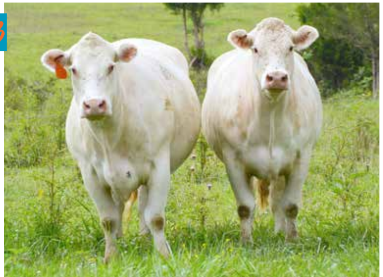
REAVES HEIFERS SELL AS LOTS 22 & 23

Safe in calf 5 Months to M6 Law & Order 577 P, our senior herdsire. Her dam by Long Distance, was the 2nd high selling Open heifer in the 2015 VA Herd Improvement Sale. She is now working for Ellis Farm, AL. 347 is a very feminine young female with a good birth weight and very good weaning wt. Ledger females tend to be very smooth and correct. The Donor cow CF Lady Cigar 812 topped a May & Son sale going to Stocum & Blackwelder.