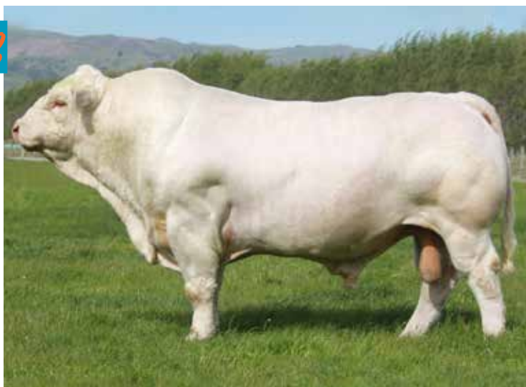
SILVERSTREAM EVOLUTION E168 SIRE OF LOT 12

Selling Full Interest and Full Possession, Fertility & Trich Tested. An outcross of the New Zealand bull Evolution that adds tremendous thickness and growth to his offspring. And perhaps one of the top 3 cows in the Webb herd, Miss Throttle Body! Her remarkable CI is 11/13; 12/14; 10/15; 8/17; 11/18; 10/19; and 9/20 with Darwin. Teague Farms have purchased 3 of her sons! She also produced the Injector herd-bull at Buzhardt Farm!