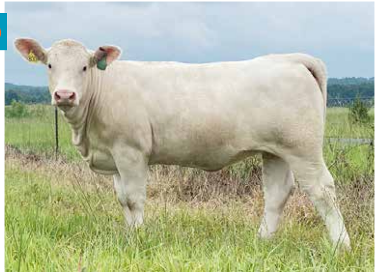
JBC MS Y757 MAXIMO 008 P ET SELLS AS LOT 90