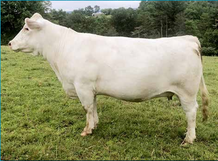
DESCO RSHMR RUTH 802 P DUE AUGUST 26 TO ONE PENNY FLASH 6424 ALSO SELLING 3 EMBRYOS, FULL SIBS TO RUTH 802P