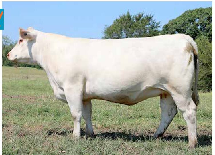
DOUBLE-H ALYSSA 906G SELLS AS LOT 101

Safe in calf to PE 4/7/21 to 7/6/21 to Mead LCC Bulls Eye T484. Performance and Carcass merit is in the blood of this young female. She ranks in the top 15% WW and YW, 10% Udder, 15% Teat, 20% CW, 15% Marb, and 20% TSI EPD scores. You love the big volume, bone, and balance of this powerful female and her statistical merits. Bulls Eye traces to Rushmore on top and out of a Ledger daughter from a Grid Maker cow!