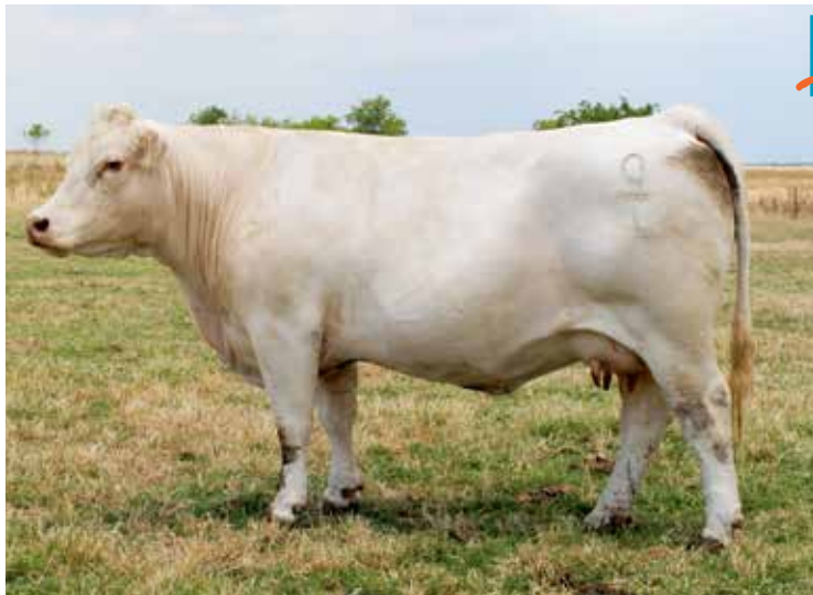
JDJ MS CIGAR S288 LOT 104 DONOR DAM

Selling 2-Embryos from mating of DC/BHD King F2503 P x OHF Ms Tradition E919. King is a $24,000 High selling bull at DeBruyckers and a homozygous Polled sire. His dam, Z767, was selected as Pick of DeBruycker herd by a Syndicate for $20,000.00. You will have excellent numbers to work with on this mating. E919 produced 17 calves and was still producing at 15 years of age!