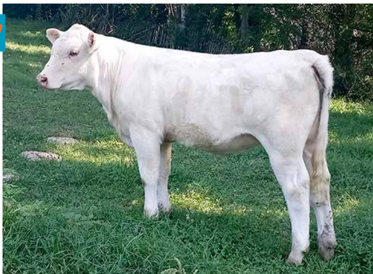
DVF MS MARY BELLE GRIMES 19 SELLS AS LOT 69

Bred 12/4/20 to Cooley Russell 1410R9, M719186. Due September 11, 2021. Her dam sells as Lot 71. Emblem and Outback bulls are two of the thicker, stouter bulls in the DeBruycker program. The Smokester x Marion blend has produced lots of champions and high selling lots on the National scene! Ask Double-H about that mating! Russell was a calving ease sire, top 10% CE and 9% BW, an Eaton x Schurshot! Halter broke!