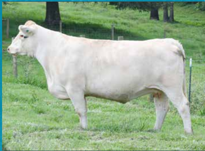
OHF NEW WINDY H831 ET DUE 9/12/21 TO JDJ SMOKESTER J1377 P ET CONSIGNED BY OAK HILL FARM