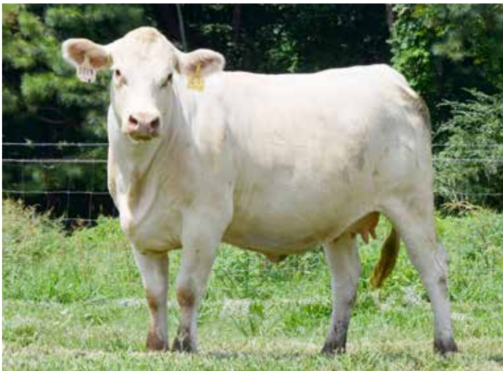
LWF MS LEGAL SMOKE 5519 SELLS AS LOT 51

50A: ET Heifer calf born 9/1/21 from embryo mating of WC Milestone 5223 P x OHF Shea Lady G815 ET, EF1253443. G815 is a VCR Sir Duke 914 x GP Ms Ali M76. (M76 has 75 calves registered with AICA) Wanda has a beautiful udder and does a great maternal job! She descends from Doub's great Kennedy cow family, know for producing many Champions in the ring! Ghost Rider calves have had tremendous success in the showing!