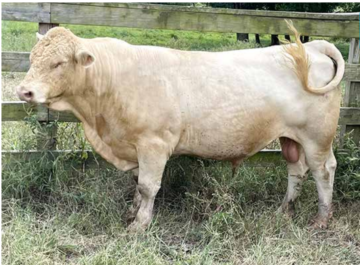
RRCA MR H458 SELLS AS LOT 14

Selling Full Interest and Full Possession, Fertility & Trich Tested. A cattleman's dream in this big, long-bodied, correct bull. He has the abundant depth and spring of rib to stay in good shape while breeding cows. A light birth weight of 71 lbs reinforced by his top 20% EPD for CE and BW. He also ranks in the top 9% for Marbling. His sire known for excellent carcass ability in his progenies. The type of Charolais bull that excites the beef industry for weaning weights, feedlots performance, and carcass ability!