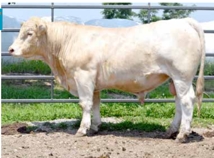
B&B MR CHAMPION 2064 SELLS AS LOT 17

Selling Full Interest and Full Possession, Fertility & Trich Tested. This good prospect is out of the very popular and easy calving bull, Fargo Y111. He ranks in the top 20% YW EPDs and 25% for TSI score. His dam has produced 5 calves for excellent productivity to base a firm foundation for practical production. Good depth of volume, superb muscling, quiet disposition, and strong top. Solid proven pedigree is an added value!