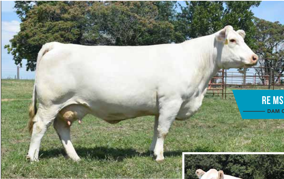
RE MS DUKE 745 ET DAM OF LOTS 95 & 96