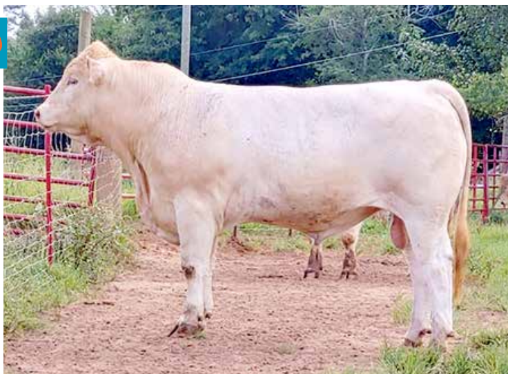
WC ZEUSTER 013 SELLS AS LOT 10

Selling Full Interest and Full Possession, Fertility & Trich Tested. A very smooth, complete bull with excellent frame, length, and skeletal correctness. Light birth weight, out of a super milking Smokester daughter from Candy Sullivan. She calved in January of 2020 and December 2020! Great fertility in this family. 013 ranked in top 6% for REA EPDs. The Webb bulls have constantly brought premium dollars due to their PRODUCTIVITY!