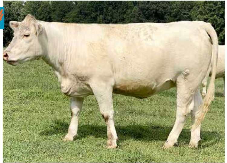
ABC MISS ROYCE 911 SELLS AS LOT 34

DUE to calve 11/10/21 to WC Boulder 8535, selling as Lot 6 in this sale. This long-bodied, strong topped cow offers abundant femininity with a clean long neck extension, good milking ability genetics, and skeletal correctness. Her good numbers offer tremendous success with her ability as a first calf heifer. Boulder has been an excellent calving ease specialist and exceptional growth afterwards. An excellent cow to build a program with.