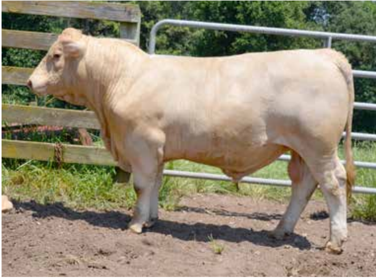
OHF MR 0830 ET SELLS AS LOT 1