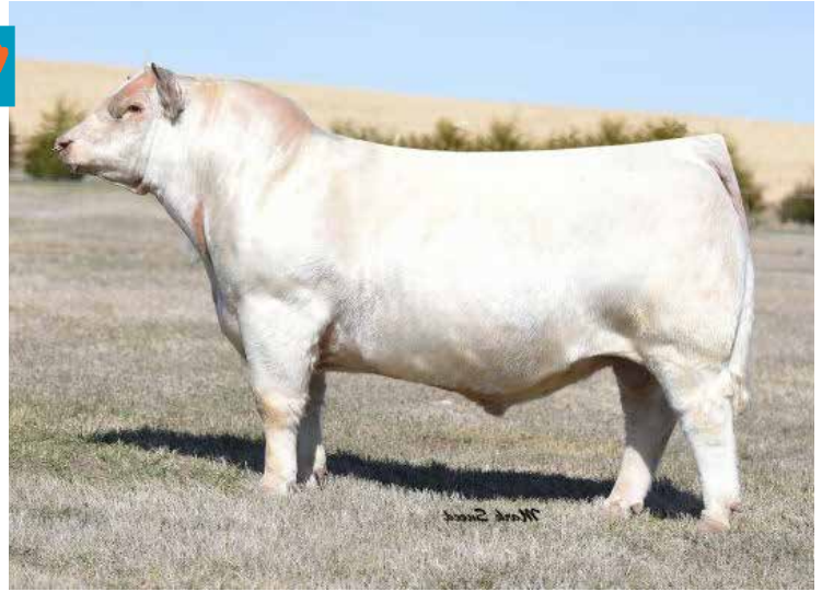
TR DSUL 100 PROOF B24 ET SIRE OF LOT 89 EMBRYOS

Selling 3-IVF Embryos from mating of TR DSUL 100 Proof B24ET x MR Ms Standard Issue 334. This is a powerhouse cow that has raised two herdsires. She is the dam of M6 Confidence 503. He sired the high selling set of bulls in the Bradley 3 Ranch bull sale in Texas. The sire is the 47th AICA Reserve National Champion from two of the strong showing genetic programs, Thomas Ranch, SD, and Sullivan Ranch, TX. His dam, an Easy Pro daughter has 63 calves registered with AICA.