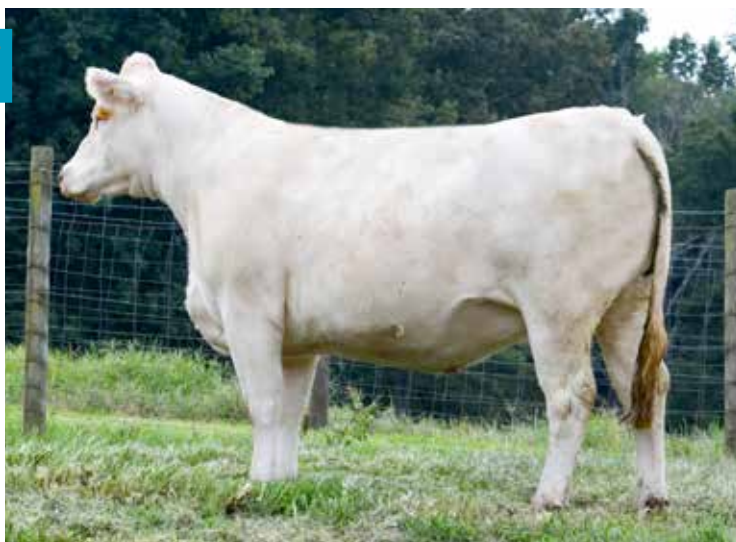
BARA MS FARGO 68F P SELLS AS LOT 48

Due 10/31/21 to Hayden G840. Tremendous growth in this powerful, meaty heifer! Ranks in the top 7% for both WW and YW EPDs, 25% in MTL, 7% in CW, 30% REA, and 25% TSI. A combination of Growth, Maternal, and Carcass ability! Bred by Candy Sullivan, Arlitt's have retained a Braxton maternal sib, and Hudspeth's have daughter also out of a Smokester son! A massive heifer in volume and scale but retains her femininity!