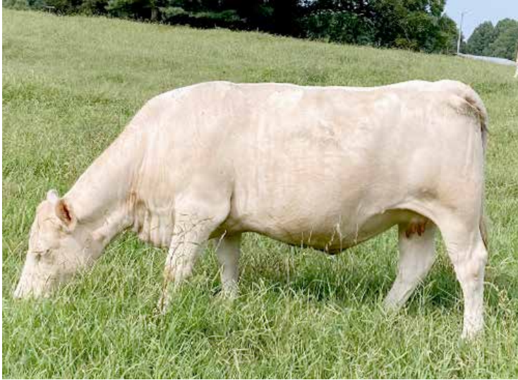
FARAWAY MAGIC DOLL 39C SELLS AS LOT 77