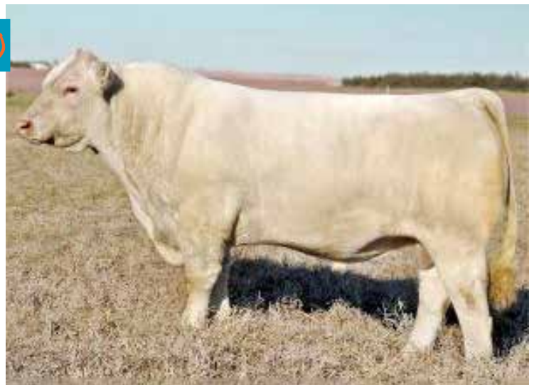
WR RANGLER W60 1 SIRE OF LOT 30