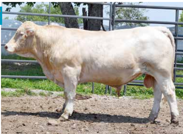
B&B MR DISTANT FIRE 2082 SELLS AS LOT 16

Selling Full Interest and Full Possession, Fertility & Trich Tested. Plenty of muscle shape and quality in this top prospect. His length, structural correctness and bone make him a logical choice to design a solid breeding program to get those outstanding Charolais cross calves. This moderate frame bull will be an easy-fleshing, good-doing kind of bull working in the pasture without excessive care or feed. A good rugged bull that will hold up the whole season.