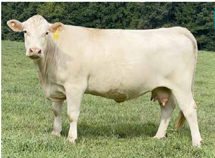
WC MAID 3553 P ET SELLS AS LOT 33

32A: Pld heifer calf # 104, born 3/2/21, bw 70, sired by WDZ Kingsman 737, M894821. Bred A-I on 6/14/21 to RBM Fargo Y111. PE from 7/12 to 8/30/21 to WC Resource 9132 ET, M926509. Good CE and BW numbers along with Milk EDPs on a top young first calf heifer. Kingsman ranks in top 15% for both WW, YW, and MTL and a good top 20% on TSI, and owned by Wagonhammer Ranches, NE.