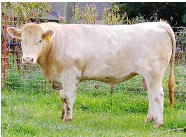
WC GAZEU 012 SELLS AS LOT 9

Selling Full Interest and Full Possession, Fertility & Trich Tested. A bull we have used with great results out of one of our best Sly daughters! GaGa has had 10 calves registered with AICA, only 2 have been ET's so she has a great fertility record. He had a good birth weight and a very good weaning weight of 713 lbs. A top 20% Milk EPD along with 15% for REA to show a great combination for a herdsire, milk and meat! Excellent disposition!