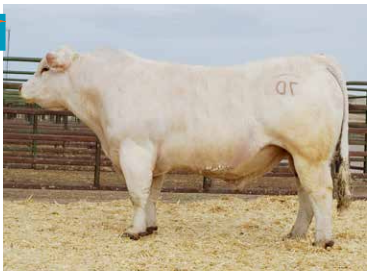
BHD ZEN X270 SIRE OFL OT 75

Bred A-I on 12/6/20 to Faraway Chico 4T, EM740142. Ranks in the top 20% WW, 15% YW, 7% CW, 15% Fat and 10% TSI EPDs for the breed. Her dam and 2-sisters remain in the herd, her great granddam is the oldest cow in herd at 13 years and still going! Her dam is a triple-bred Grid Maker cow who is the favorite cow in the herd. Zen has been doing a fantastic job, his daughters have been the dams of many of the top selling bulls in DeBruycker's bull sale.