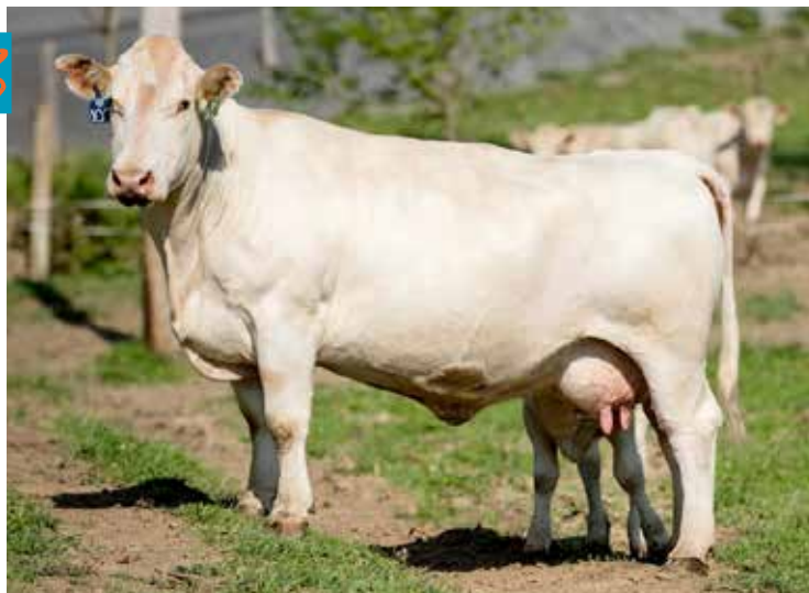
WCR MS DUKE 6025 DAM OF LOT 68 EMBRYOS

Selling 3 embryos from mating of LT Rushmore 8060 Pld, M760665 x WCR Ms Duke 6025 P/S. The calving ease combo of 6025 and Rushmore will make these calves easy to keep or sell regardless of their gender. 6025 has progeny all over the U.S. as well as Asia, Europe, and South America! She has 65 progenies registered with AICA. The great NF Agatha 9581 also traced back to Bond and goes all the way to Shultz Tornado, one of the early performance polled bulls.