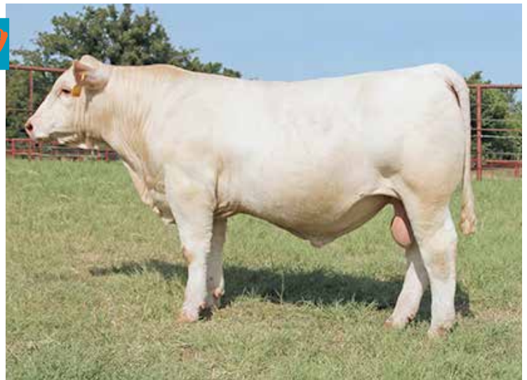
M6 LAW & ORDER 577 P SIRE OF LOT 29

Sells PE to Lot 20, Reaves Mr Standard 2080, status announced sale day. Another top-end replacement for a very selective herd! EPDs rank in top 25% for WW and YW, 20% Milk, 15% MTL, 9% REA, 30% Marb and 20% TSI. Gridmaker daughters have been great producers, and this elite package traces back to M6 Ms E46 Duke 248 donor that has 183 progenies registered with AICA. Her calf will have a super pedigree!