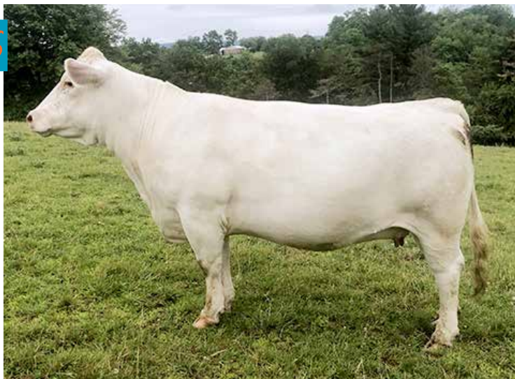
DESCO RSHMR RUTH 802 P SELLS AS LOT 66

Pld heifer calf # 114, born 8/25/21, bw 78, sired by One Penny Blanco Flash 6424, M731925. Ruth has been flushed 4-times with an average of 12.5 freezable embryos per flush. We have exported embryos to South America from her. She has 6 EPDs that are in the top 10% of the bred and 2-more in top 15%. Her calf is in top 6% YW, top 10% CW, and top 2% Marb EPDs. Her dam is our featured Donor and we have full sib embryos for Lot 68 to Ruth.