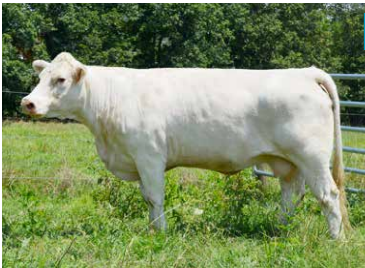
MS MAZEPPA CHEYENNE 422 SELLS AS LOT 65

Sells Open. Several former AICA Trait Leaders in this pedigree, Duke 9003, Hank, Eli Ali, and Duke 914. Her dam, 1020 has 23 calves registered, and the $50,000 Granddam, E205 has 95 calves. The Ruby Family like many prominent maternal lines all trace to HBR Lady Performer 934! Solid foundation in this top-end young prospect to evaluate for donor cow potential. Peugeot added tremendous growth and thickness.