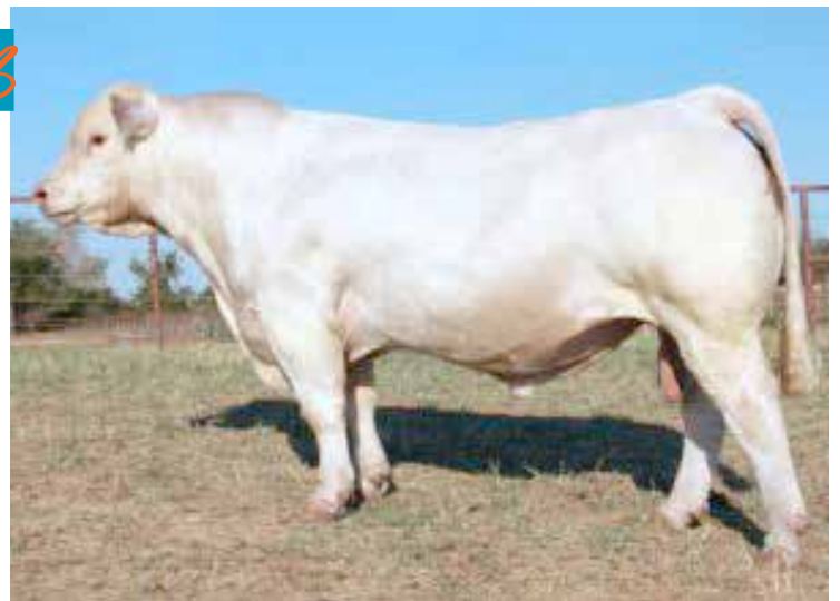
M6 FRESH AIR 8165 P ET SELLS AS LOT 108

Selling 10 units of semen on M6 Fresh Air 8165 P ET. Tried and proven many times, this sire has tremendous females. The Germaine cow family is one of the most respected in the breed. Lady Ease 914 is also the dam of SR/NC Field Rep 2158, a well-used and popular sire! Wind 0383 added so much eye-appeal and style in his calves. A great addition to your program.