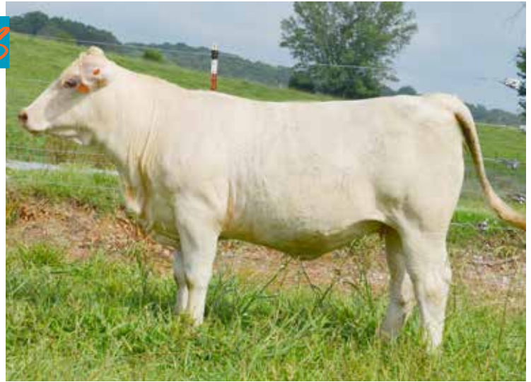
REAVES LADY L&O VENIS 2024 SELLS AS LOT 28