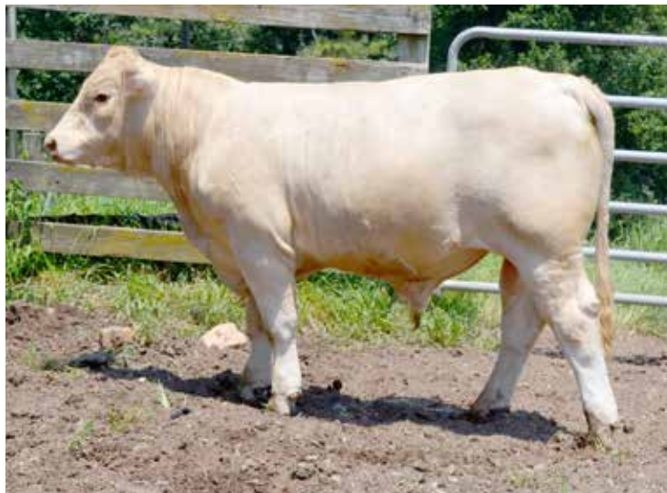
OHF MR 0813 ET SELLS AS LOT 2

Selling Full Interest and Full Possession, Fertility & Trich Tested. One of the premiere offerings this fall in the great son of Cigar, one of the most influential sires in the history of the breed. His dam is equally impressive, a superb donor at Bamboo Farms before going to Herndon Farms. One of the top Duke 914 daughters in the breed from a stacked pedigree of great ones, including her legendary dam, D029! Pedigree, Conformation, and growth to move any herd into a national highlight!