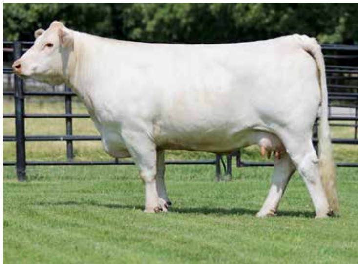
OHF VANESSA 4131 DAM OF LOT 3