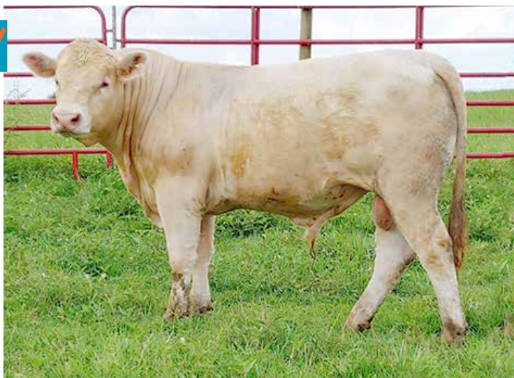
WC RIP 062 SELLS AS LOT 11