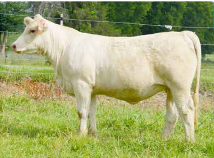
REAVES MS LAW SLAM 2023 SELLS AS LOT 27

Sells PE to Lot 20, Reaves Mr Standard 2080, status announced sale day. A beautiful, feminine head on this long, clean necked maternal power heifer. Tremendous eye-appeal as you would expect from a Resource daughter! EPDs rank in the top 15% for Milk, 20% for MTL, 15% REA, and 20% for Marbling comparisons. The M6 New Jewel 0155 is in Holloway ET program and 1130 is in Blackstreet Angus program, SC.