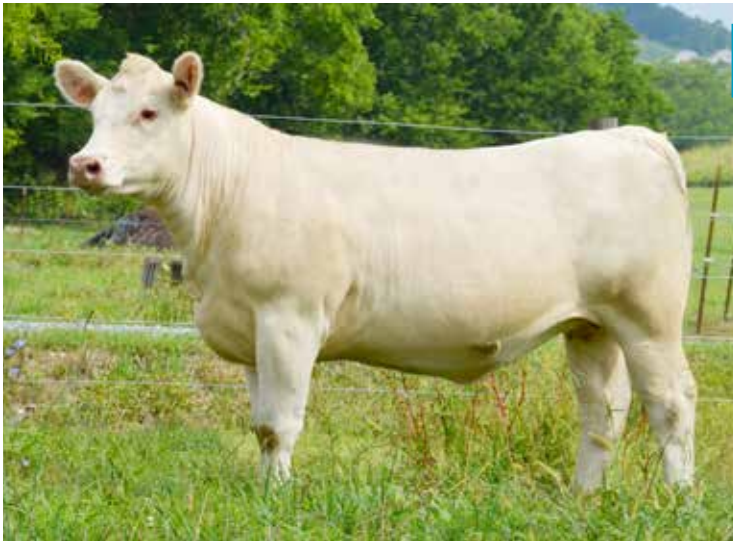
REAVES MS RESOURCE 2014 SELLS AS LOT 26

Safe in calf 5 Months to M6 Law & Order 577 P. An ultra-feminine heifer out of the syndicated Milestone sire. M6 genetics on the bottom side including SR Lady Ease 914, the dam of M6 Fresh Air 8165 and SR/NC Field Rep 2158 just to name a few of her 45 progenies registered with AICA. Her EPDs rank in the top 25% for WW, 30% YW, 20% Milk, and 15% MTL, 9% REA, and 35% for TSI for the breed comparisons.