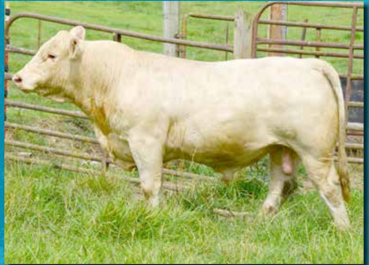
REAVES MR STANDARD 2080 M6 NEW STANDARD 842 P ET X M6 COOL GERMAINE 1145 CAN HIGHLIGHT ANY BREEDING PROGRAM!

BIGGER AND BETTER THAN EVER! SELLING 20 BULLS & 70 TOP QUALITY FEMALES