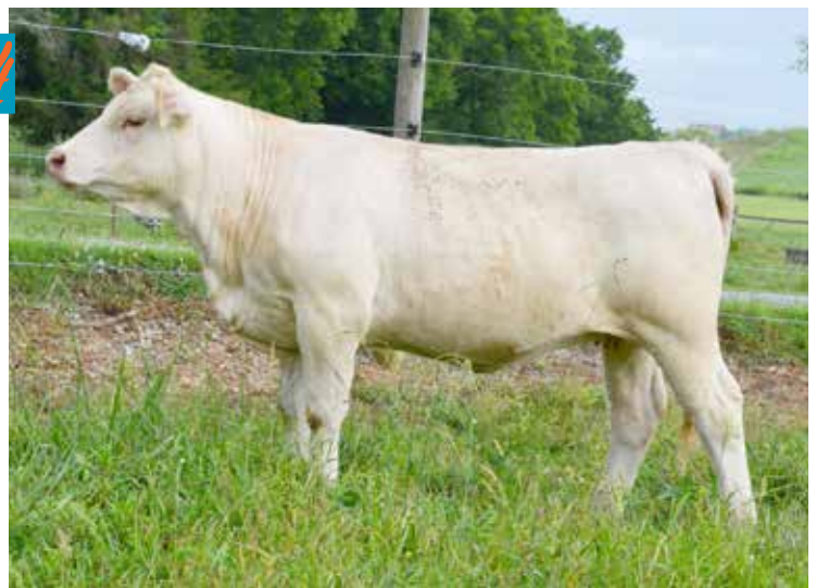
REAVES MS MOLLY 2013 SELLS AS LOT 24

Sells PE to Lot 20, Reaves Mr Standard 2080, status announced sale day. This very broody young heifer displays tremendous depth and spring of rib. A big, long top, square hip, with good muscle pattern. She already shows a good udder development with proper teat spacings. Excellent CE and BW numbers and a top 3% ranking for REA. This heifer also traces to the great Evans' donor cow, the incomparable JDJ Ms Dynasty L428!