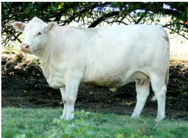
BC PERFECT MARK P ET LOT 105 DONOR DAM

Selling 3-Embryos from mating of BHD Reality T3136 x JDJ Ms Cigar S288. S288 was a top pick of bred heifers in DeBruycker's Taste of our Best sale. She has produced several top end selling females in previous sales. She has produced 23 calves that are registered. Reality produced lots of growth and performance. Cowmen loved his bulls. The best of females are super good!