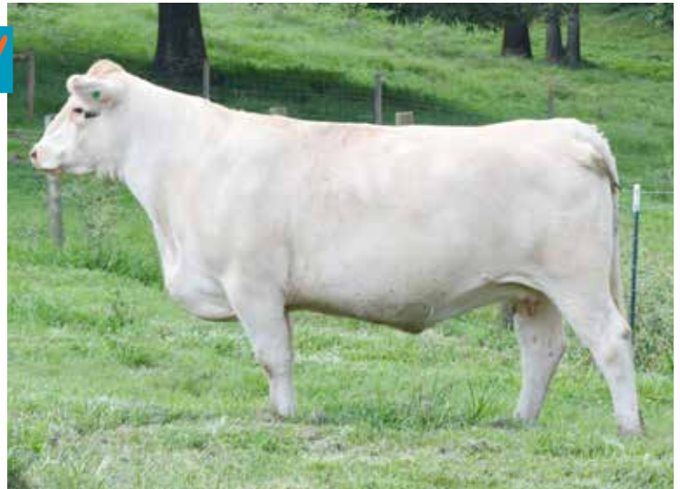
OHF NEW WINDY H831 ET SELLS AS LOT 41

Due 9/12/21 to JDJ Smokester J1377 P ET. Quite a potential donor cow here coming with her 2nd calf. In fact she will move up a month on her calving. Excellent size, depth and spring of rib, good square rump structure, good bone, and great length. Marvelous udder quality and from a very sound foundation. Her dam is in Herndon Farms ET program. G224 has produced 39 calves and the Matriarchs of the Vanessa's, D029 has produced 106 progenies.