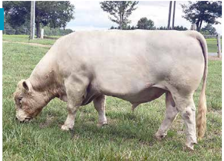
WC BOULDER 8535 P SELLS AS LOT 6

Selling 67% Interest and Full Possession, Fertility & Trich Tested. Wright Charolais owns the 33% semen Interest only. A rare opportunity to invest in a slightly older, but very proven herdsire! A tremendously easy calving bull as evidenced by his 12.1 EPD! (a well known fact about Rushmore genetics) Blue Value has added abundant performance and style to his progeny. Ranks in the top 9% CE, 15% BW, 25% WW, 1% Milk, and 2% MTL for EPDs. Very important with today's demands, he is also in top 15% for Marbling.