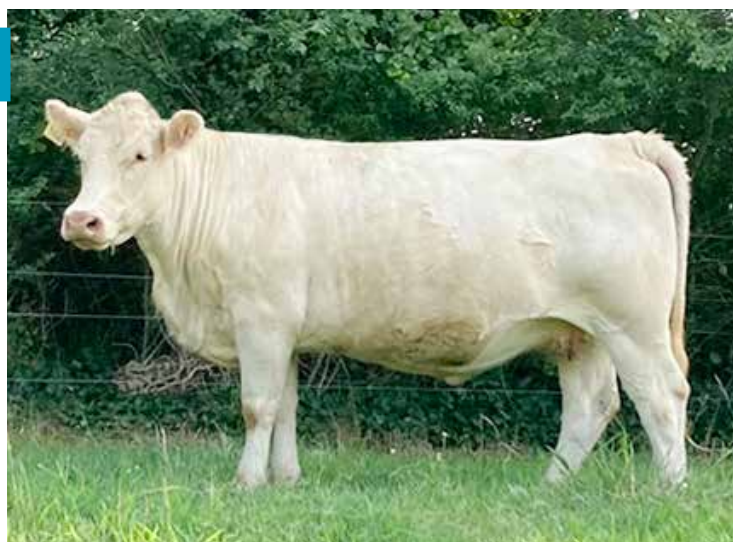
FARAWAY MS SUPREME 23E SELLS AS LOT 76

Bred A-I on 12/6/20 to WAG Bacchus Cotano, M48190, a refence sire in the original AICA Sire Evaluation program. He is above breed avg in BW, top 35% for Maternal calving ease, well above average in udder and teat traits. Rich foundation of Full French imported genetics blended with foundation 4T Ranch, TX, tracing to AICA #1 Miss Lin 33. Granddam was Res Champion Female at American Royal and Top Ten Show heifer of the year and twice National Reserve Division winner!