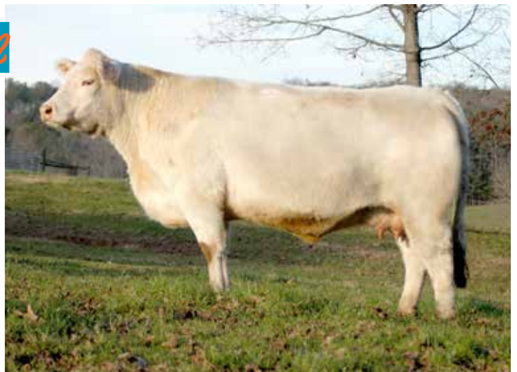
OHF TRADITION E919 LOT 102 DONOR DAM