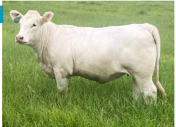
JBC MS MILESTONE 003 P ET SELLS AS LOT 91

Sells Open. Rich pedigree of proven genetics in this stylish young heifer with a big hip displaying lots of muscle and thickness. Her dam, Nancy 007 has produced 16 calves for Blackwelder, NC, Agricola, VA, and Hat Creek, VA. Nancy 6100 produced 128 progenies and was a top purchase by Double H, MN. With this stout pedigree you can channel your program in many directions to obtain maximum success.