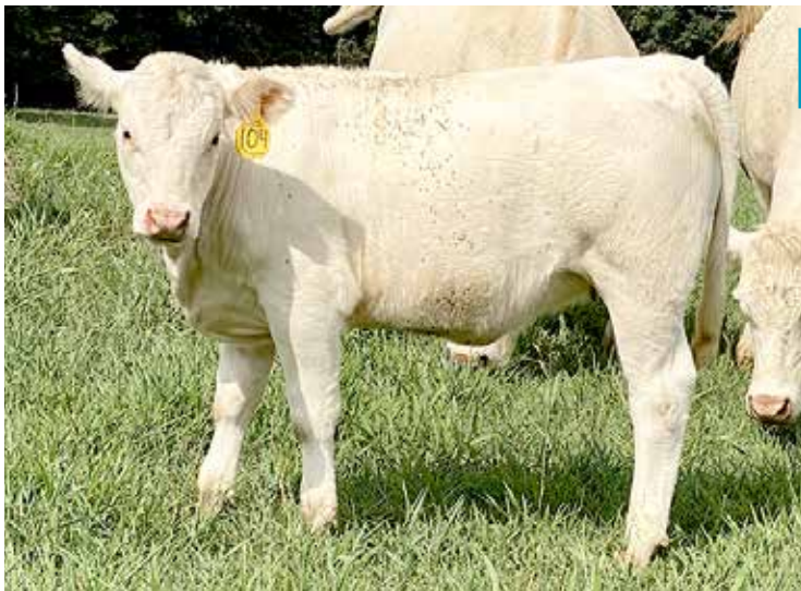
32A HEIFER CALF

Selling Open. EPDs rank in top 25% WW, 35% YW, 3% Milk, and 4 % MTL for breed comparisons. Quite a pedigree here on this magnificent heifer! Her dam is a full sib to lots 111 and 112, all full sibs to previous high selling lots in a Southern Connection sale. Their sire traces to a Cigar dam, 2070, is one of the all-time great donor cows in the breed. Ruby traces to JWK Ruby E205, a $50,000 donor cow! Good investment here!