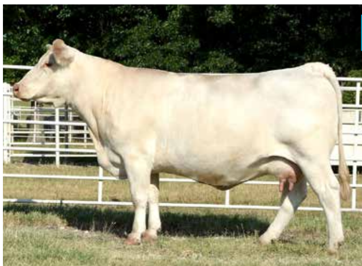
WELCOME GROVE ANN 1213 DAM OF LOT 58

Embryos are located at Bovine Elite, College Station, TX. Buyer pays all shipping and handling fees. Miranda's dam has produced 11 calves. Miranda is now part of Cawley Cattle Co's, GA., ET program. Reliable is out of the very poplar performance and carcass sire, Raile 2250 T077. Reliable is owned by MW Farms, TN, Clear Water, MS, Southern Cattle Co, FL., Bamboo Road Farms, GA., and Nipp Charolais, OK.