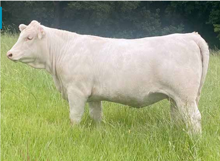
JBC MS PERFECT LEADER 023 P SELLS AS LOT 94

Sells Open. Another feminine yet rugged broody cow look that makes for an easy-keeping, good doing type of cow. F40 had one of the most perfect udders in the breed, a donor cow for Morley and Ragsdale, TX. First Lady is a donor for Arlitt Ranch, TX and Clear Water Cattle, MS and out of the great legendary JDJ Ms Dynasty L428! ABC Leader L165 was one of the more popular used bull to come out of the Cobb herd, MT.