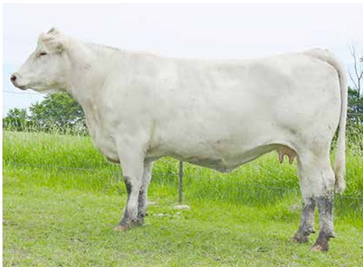
NGC MACY 607S DAM OF LOT 36